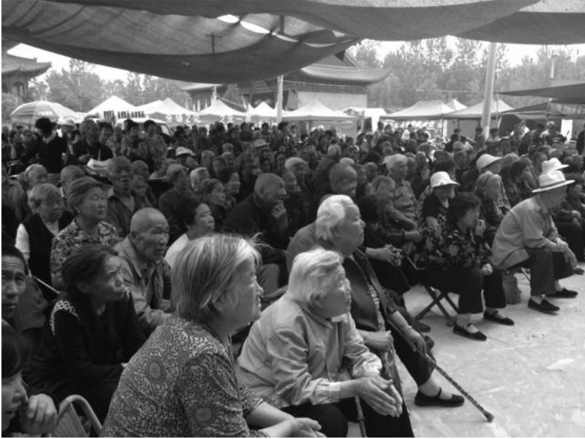
FIG. 3. The audience for the Puju daytime performance on the 22nd day of the fourth month (May 31, 2013).

friends, and would comment on the performances with each other. But because the temple is a little distant from either North Yangxie or South Yangxie, only those old people who have filial sons to drop them off at the temple before the evening performance starts and pick them up after the show could get there in comfort. Some of the old people who lived far away came to stay with their relatives in Yangxie in order to watch the performances.