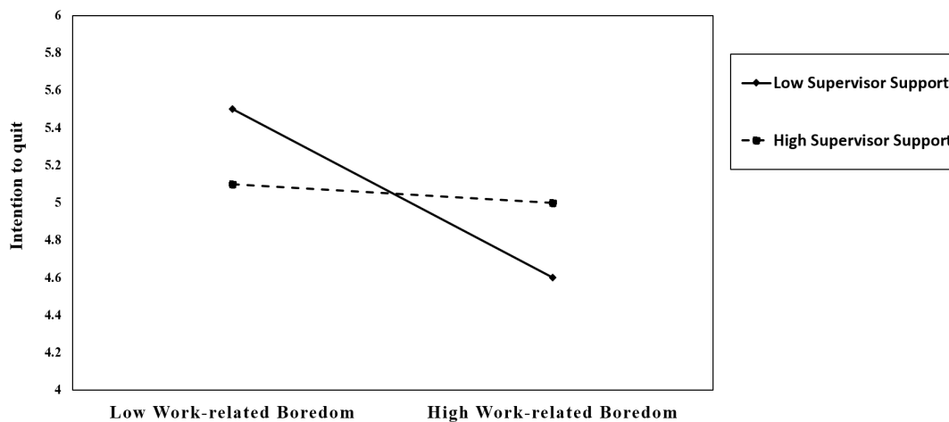
Figure 2. The Plotted Interaction of the Moderating Effect of Supervisor Support in the Relationship Between Work-Related Boredom and Intention to Quit