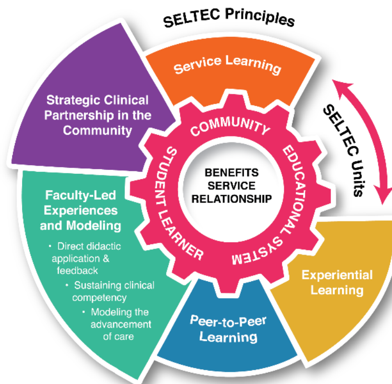
Figure 1. SELTEC Model Units and Principle Relationships.