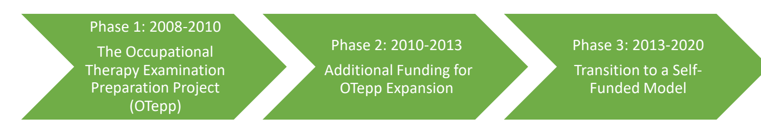
Figure 1. OTepp program timeline.

program for IEOTs: The Occupational Therapy Examination and Practice Preparation (OTepp) program. The purpose of this paper is to: 1) provide a detailed description of the development, implementation and evaluation of the OTepp program across three phases, and 2) distill the key lessons learned at each phase, thereby enabling others to consider them in their own context, as appropriate. Figure 1 illustrates the 12-year evolution of the program through a timeline of the three major phases.