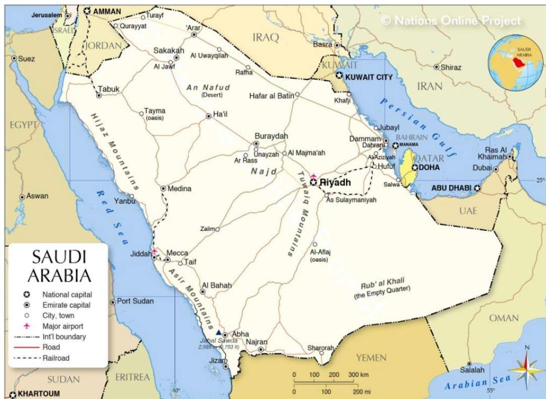
Figure 1 Saudi Arabia Map

and Oman. On the eastern side, it borders the Persian Gulf and the United Arab Emirates. The western side also borders the Red Sea (Ministry of Foreign Affairs, 2016).