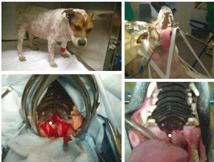
Figure 4. (a) Photograph of a dog with pituitary-dependent hyperadrenocorticism; (b) The same dog under general anaesthesia placed in sternal recumbency and head placed in a surgical head brace to maintain an elevated head position; (c) The soft palate has been incised and retracted. The pituitary fossa has been exposed after burring the basisphenoid and presphenoid bones; (d) The soft palate has been closed using absorbable suture material.

Several prognostic factors have been proposed when using trilostane or mitotane therapy. Older age and heavier weight are negative prognostic factors reported in several studies; higher one hour post-ACTH serum cortisol, weakness at presentation, hyperphosphataemia and severity of clinical signs have also been reported as negative prognostic indicators (Kintzer and Peterson, 1991; Barker et al, 2005; Clemente et al, 2007; Arenas et al, 2014; Fracassi et al, 2014).