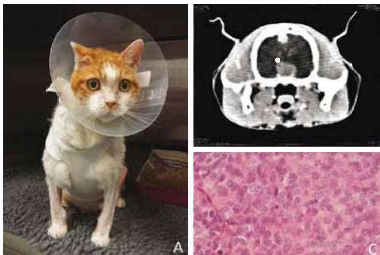
Figure 5. (a) Photograph of a cat with a diagnosis of pituitary-dependent hyperadrenocorticism; (b) Contrast enhanced computed tomography of the same cat showing pituitary enlargement; (c) Photomicrograph showing haematoxylin and eosin staining of the pituitary tissue collected during the hypophysectomy surgery of the same cat. The cells are polygonal and exhibit the eosinophilic cytoplasm that is typical of corticotropes.