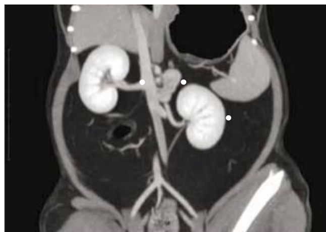
Figure 6. (a) Ultrasound image of an enlarged adrenal gland. The gland has the characteristic 'peanut' shape but is enlarged at the cranial aspect; (b) A sagittal image of contrast-enhanced abdominal computed tomography identifying an enlarged adrenal gland; (c) A dorsal image of contrast-enhanced abdominal computed tomography. This is the same adrenal gland as in 4b, showing the relationship of the adrenal gland to the kidneys and caudal vena cava.