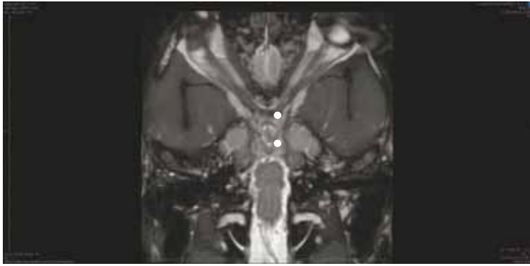
Figure 3: Dorsal view of a T2-weighted intra-cranial MRI to show the location of the optic chiasm and pituitary gland. Optic chiasm compression could be caused by a pituitary macroadenoma.

Life-long therapy is prescribed as an initial ‘loading-phase’ typically over eight days, followed by a ‘maintenance phase’. The average maintenance weekly dose of mitotane in one study of 184 dogs was 71 mg/kg, but relapse of clinical signs was common using this protocol, with around 50% of dogs experiencing clinical relapse within the first year of therapy, and the loading phase may need to be repeated in this scenario (Kintzer and Peterson, 1991).