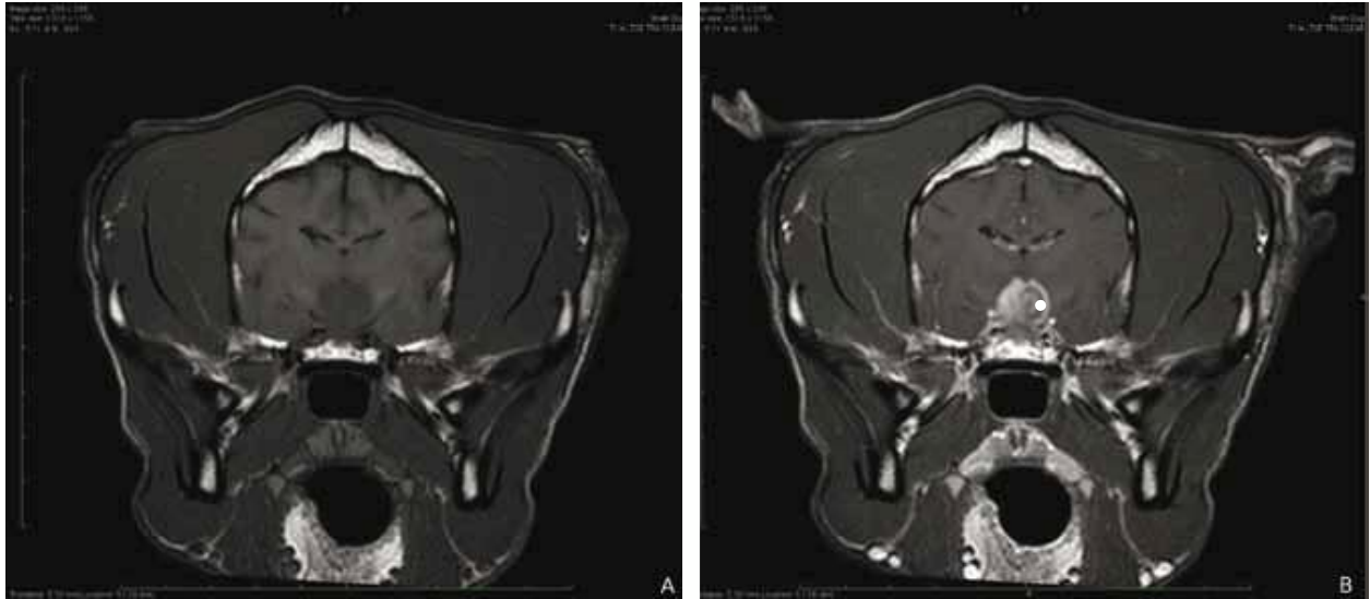
Figure 2. Use of contrast-enhanced T1-weighted MRI to aid diagnosis of a pituitary enlargement in a dog with hyperadrenocorticism; (a) pre-contrast enhanced T1-weighted intra-cranial MRI; (b) post-gadolinium contrast enhanced T1-weighted intra-cranial MRI.

The Veterinary Medicines Regulations allows UK veterinarians to prescribe medications for use other than the authorised use if there are no licenced products or if the licenced product is unsuitable. Prescription of a non-licenced product should be considered if a patient experiences significant adverse drug effects or the licenced product is ineffective at controlling the disease. Veterinary surgeons should consider the reliability of the original diagnosis of HAC before prescription of an alternative medication, because nearly 90% of hyperadrenocorticoid dogs experience rapid clinical improvement during trilostane treatment.