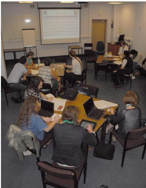
PhD Pre-Conference Workshop at the University of Bristol, 9 th July 2014. The first members of the new community working hard