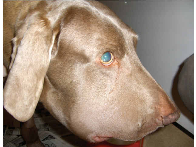
Figure 2. Dog with marked interstitial oedema where fluid has accumulated in the extracellular fluid compartment.

Colloids are high-molecular-weight compounds (molecular weight higher than 30 kDa) that, in the normal physiological condition, do not readily leave the intravascular space and contribute to maintaining, or possibly improving, the patient's plasma oncotic pressure. Colloids are classified as synthetic (e.g. hydroxyethyl starches, gelatins, dextrans) or natural (e.g. plasma, albumin solutions, blood). The potential benefits of colloids include prolonged intravascular