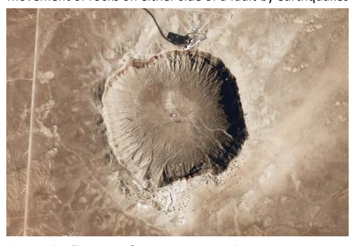
Figure 1: Satellite image of Barringer or Meteor Crater, Arizona U.S.A. The dark rectangle at the top is a museum. (http://earthobservatory.nasa.gov/IOTD/view.php?id=39769)

As terrible as these impacts were, none of them left craters. According to the Earth Impact Database (PASSC, 2015), there are almost 200 verified craters on Earth's surface from even bigger impacts, almost none of which occurred during recorded human history. Oddly, most of them were not identified as impact structures until the late 20<sup>th</sup> century. Geologists generally attribute features like craters and canyons to events we can see taking place today or in recorded history, like erosion by rivers, gradual movement of rocks on either side of a fault by earthquakes over time, volcanic eruptions, etc. Craters