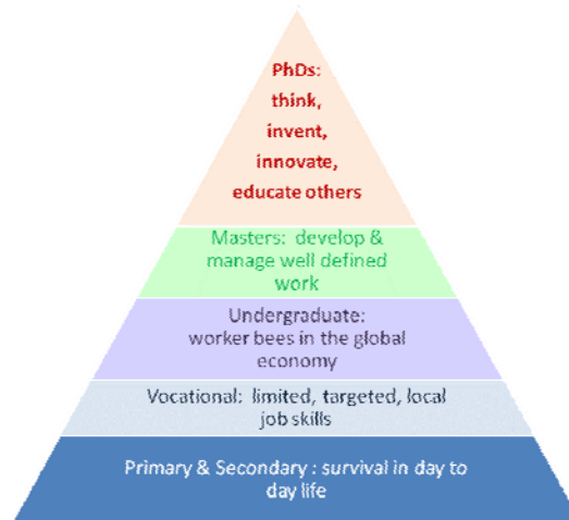
Figure 3: PhDs will be critical to aspiring knowledge economies

Besides discussing importance of research-based higher education and more PhDs, we study the competition and assess current state of progress made by US and China (which Gujarat aspires to compete with), contrast it with current state in Gujarat and India, and provide some prescriptions that can enable Gujarat to succeed in building the knowledge society.