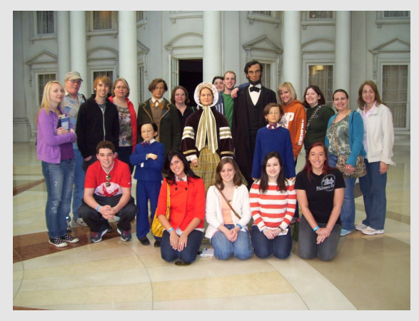
The group in front of the Abraham Lincoln Presidential Library and Museum