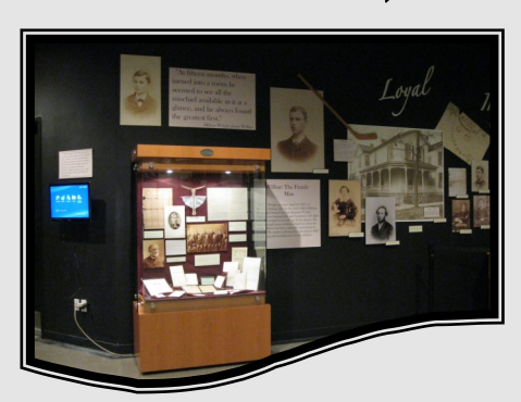
Pictured in the upper right corner is the hockey stick that knocked out Wilbur's two front teeth when he was a teenager