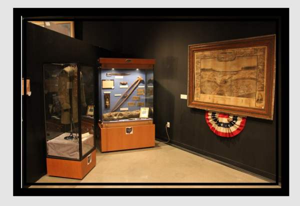
Two of the exhibit cases feature military uniforms and weapons

Artifacts including uniforms, weapons, paintings, a print of the Andersonville Prison, letters, tintotpyes, and a local Civil War flag are creatively interspersed throughout the exhibit space.