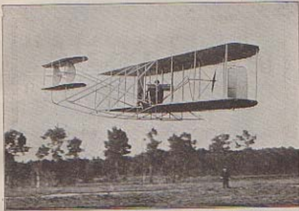
Ein mit Continental-Aeroplanstoff bespannter Flugapparat von Wright.

Die bekanntesten und erfolgreichsten Flugapparate der Welt