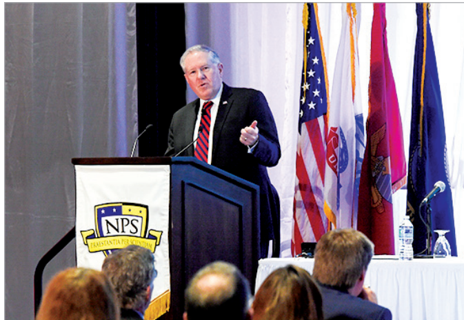
The Honorable Frank Kendall, Under Secretary of Defense for Acquisition, Technology and Logistics addresses attendees at the Naval Postgraduate School's 12th Annual Acquisition Research Symposium, May 13.

"Other symposiums or conferences that you go to have a very large 'trade show' component to them, that is not the case with our symposium," he continued. "This is a meeting of practitioners and scholars in defense acquisition and it provides them with an opportunity to talk about the direction of the department."