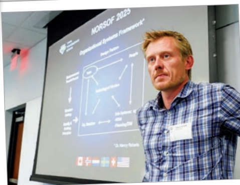
A Norwegian Army student listens to questions about his nation's future military force structure during the Norwegian Special Operations Force 2025 Seminar, May 12.