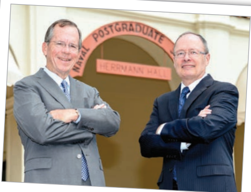
NPS Distinguished alumni and Hall of Famers retired Adm. Mike Mullen and retired Army Gen. Keith Alexander stand in front of Herrmann Hall, following an impromptu academic awards presentation, June 1.