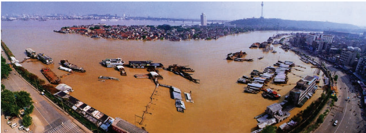
FIG. 2. Summer monsoon flood of Yangtze River near Wuhan City, Hubei, China, 26 Jul 1998. (Image courtesy of Beijing Climate Center/East Asian Monsoon Activity Center, China Meteorological Administration).

and associated heavy rainfall. Mesoscale modeling studies show that increasing the resolution of smaller-scale topographic features over the Plateau leads to improved forecast skill of heavy precipitation over the Yangtze River Valley. The long-standing problem of heavy rainfall upstream of mountain barriers (e.g., the Western Ghats) in monsoon regions is being addressed via observations, such as high-resolution Tropical Rainfall Measuring Mission (TRMM) Precipitation Radar data, and modeling studies.