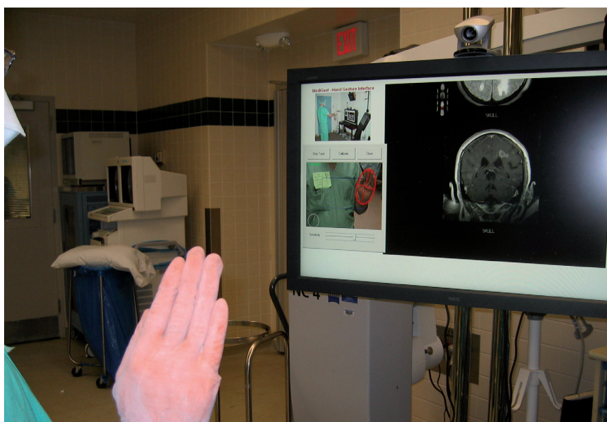
Figure 1. Use of Gestix in the OR

Institute for Medical Informatics Washington Hospital Center Washington, DC, USA