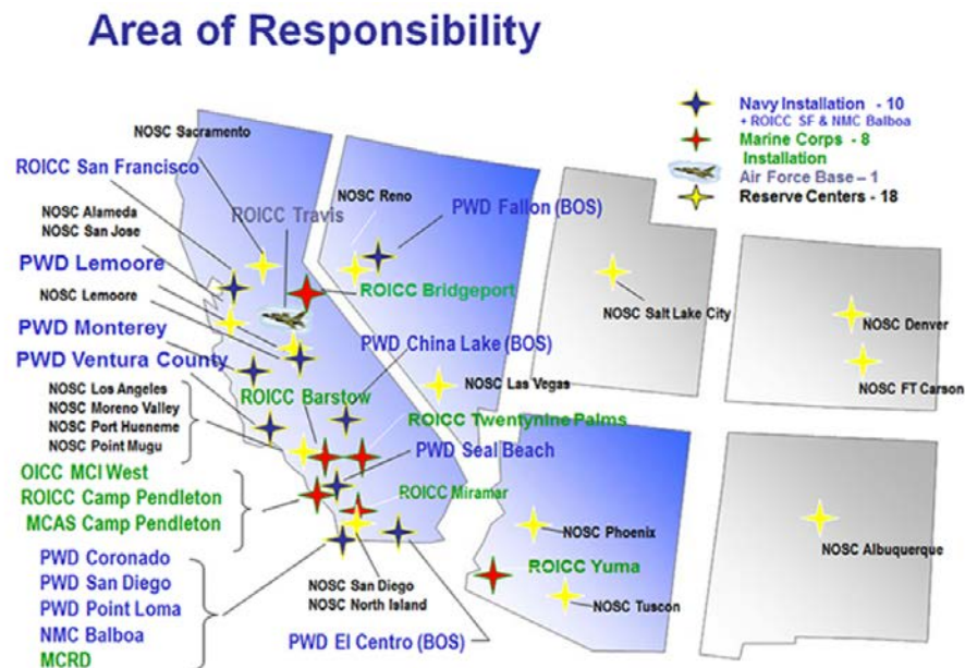
Figure 1. NAVFAC SW Area of Responsibility (after Naval Facilities Engineering Command [NAVFAC] 2015)

This chapter will discuss the background, the mission statement, and the organizational structure of NAVFAC SW. NAVFAC SW is one of the ten facilities engineering commands (FECs) NAVFAC (Naval Facilities Engineering Command [NAVFAC], 2015). NAVFAC SW's area of responsibility spans California, Nevada, Arizona, Utah, Colorado and New Mexico. This is illustrated in Figure 1, NAVFAC SW provides public works, planning, engineering/design, construction, real estate, environmental services, and acquisition / disposal of facilities and real estate for ten Navy Installations, eight Marine Corps Installations, one Air Force Installation and eighteen Reserve Centers.