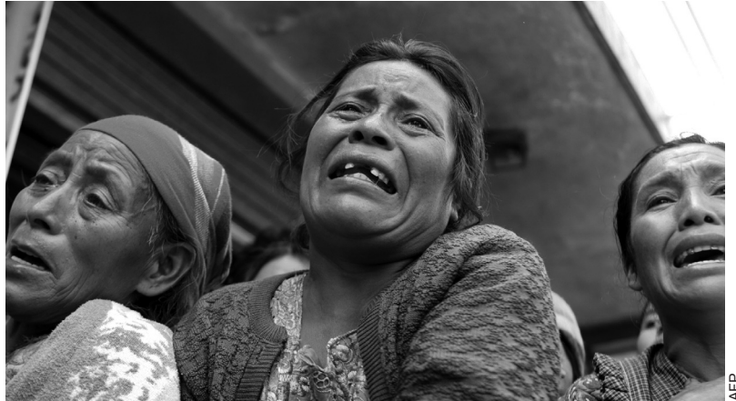
Guatemalan women weep after the discovery of four dead members of an indigenous family, two of them minors, killed approximately 800 meters from the Guatemalan National Congress in the capital, 3 August 2006.

In addition to these national efforts, many bilateral, multilateral, and regional efforts aim to combat the maras. For example, Berger and Vicente Fox, Mexico's president, agreed to establish mechanisms to fight mara drug trafficking along their border. Similarly, Berger and El Salvador's Saca agreed to set up a joint security force to patrol gang activity