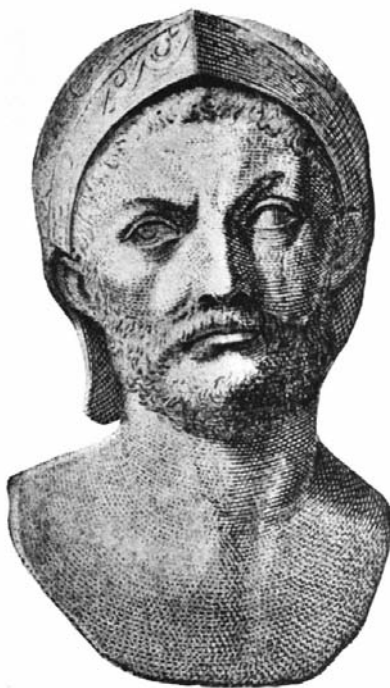
HANNIBAL, AFTER A MARBLE BUST DISCOVERED AT CAPUA.

Mediterranean world, responded by fielding a crusher of a field force, basically four consular armies welded haphazardly together, and invited Hannibal to fight that. With breathtaking guile on August 2, 216 B.C., he surrounded it on a plain near the abandoned town of Cannae, and then over the