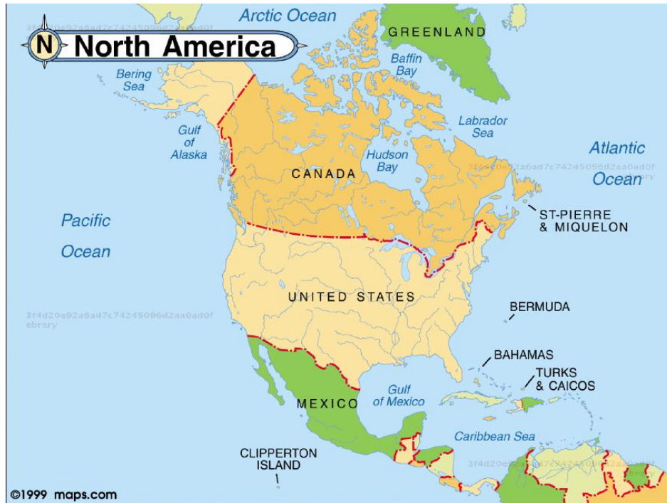
Figure 1. North American Continent 5

This thesis examines two questions: 1) Are U.S.-Canadian border policies sufficient and effective in keeping the homeland secure? 2) Is there a different method to balance safety with commerce across the U.S.-Canadian border? The model to be examined is a fully open border, similar to the Schengen Convention (SC) in Europe that created an open area between the SC signatory nations. If applied to the U.S.-Canadian border, such an arrangement could permit the free flow of both goods and people. 6