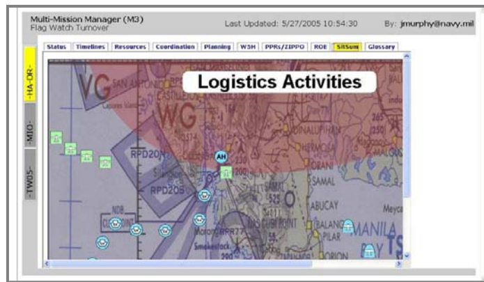
Figure 2. Example M^3 Page.

The second independent variable — information sources — emulates network-centric warfare concepts, and has two levels: the Multi-Mission Manager ( M^3 ) and shared folders. All players will have access to all the information, however the way that information is organized will vary: The organization of information emphasizes role-dependent information. When presenting the M^3 level of the variable, participants will access information via “ M^3 Pages”— web pages which integrate information from multiple sources into a single product. Information within the M^3 pages is organized around the participant’s tasks. Information in the webspace is organized using the M^3 tool. When the M^3 is not present, information is available, but organized in a shared-folder schema. The information space provides tactical information needed primarily by the future planners; however (different) information in the webspace is also needed by the execution DMs.