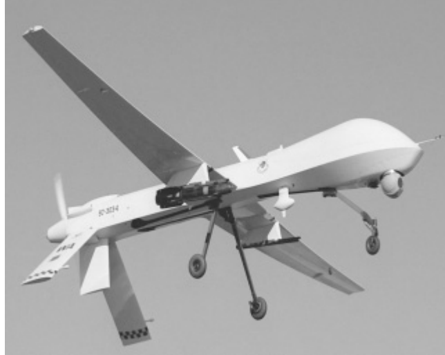
Figure 5. Predator A (Drew et al., 2005)