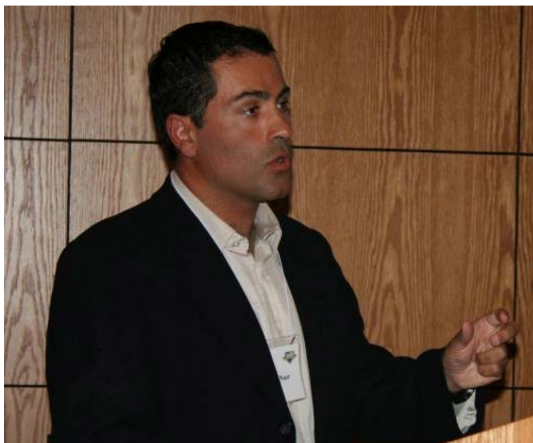
Dr. Vali Nasr describing Iran's strategic culture.

The slight discrepancies in these two presentations only reiterated the theme raised above: the lack of a consensual definition and the disagreement on which levels of analysis better embody and display the true strategic cultures of states.