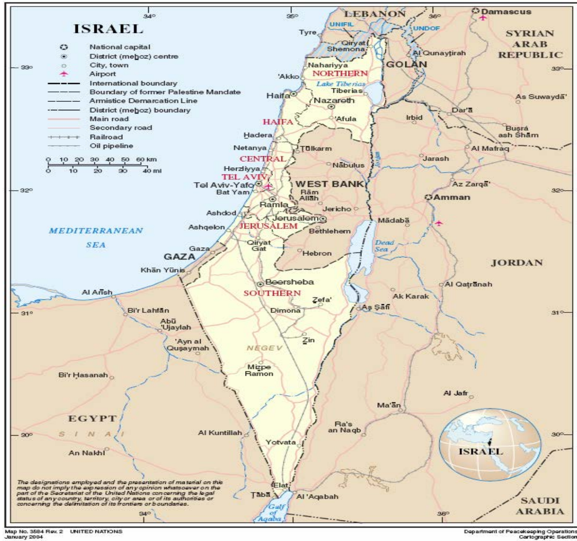
Figure 1. Modern Israel Map

only focus on the religious objections to a peaceful two state solution. Figure 1 depicts the West Bank and Gaza land that is disputed by Hamas and Gush Emunim.