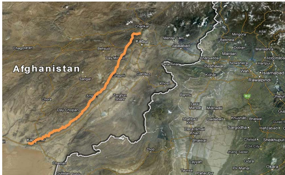
Figure 1. The “scientific frontier” on the Kabul-Ghazni-Kandahar line 19

This new strategy necessitated the control of mountain passes in the tribal areas to improve communication and set advanced military posts to secure the strategic line. To secure the border, the British established a working relationship with Amir Abdur-Rehman Khan of Afghanistan, and to administer tribal areas, appointed political agents (PAs) and stationed scouts in strategic locations. The Durand Line was set in 1893. 20