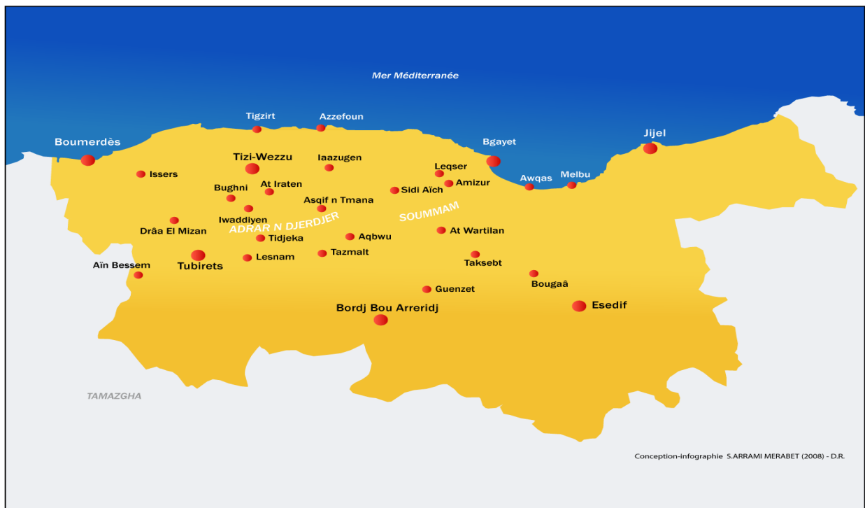
Figure 4. Kabylia main cities

The Kabylia region sits between the provinces of Jijel in the east and Bouira in the south. The region includes seven administrative provinces: Boumerdes, Tiziouzou, Bejaia, Setif, Jijel, Bouira and Bordj Bouariridj (see Figure 4–5) with almost 22,300 square kilometers in total. 131 Geographically, Kabylia is divided into two major parts, separated by mountain ranges: Greater Kabylia and Lesser Kabylia. The two regions are separated in the east by the Soummam and Seybouse rivers. The coastal areas are largely mountainous in the eastern part of the region, except for the coastal cities of Bejaia and Jijel. The mountainous region of Kabylia varies from 1,300 to 4,300 feet in elevation, with the highest peaks being Lala Khadidja, Haizer, and Timedjoune. 132 In the interior, the southern provinces of Setif and Bouira are marked by wide, high plains.