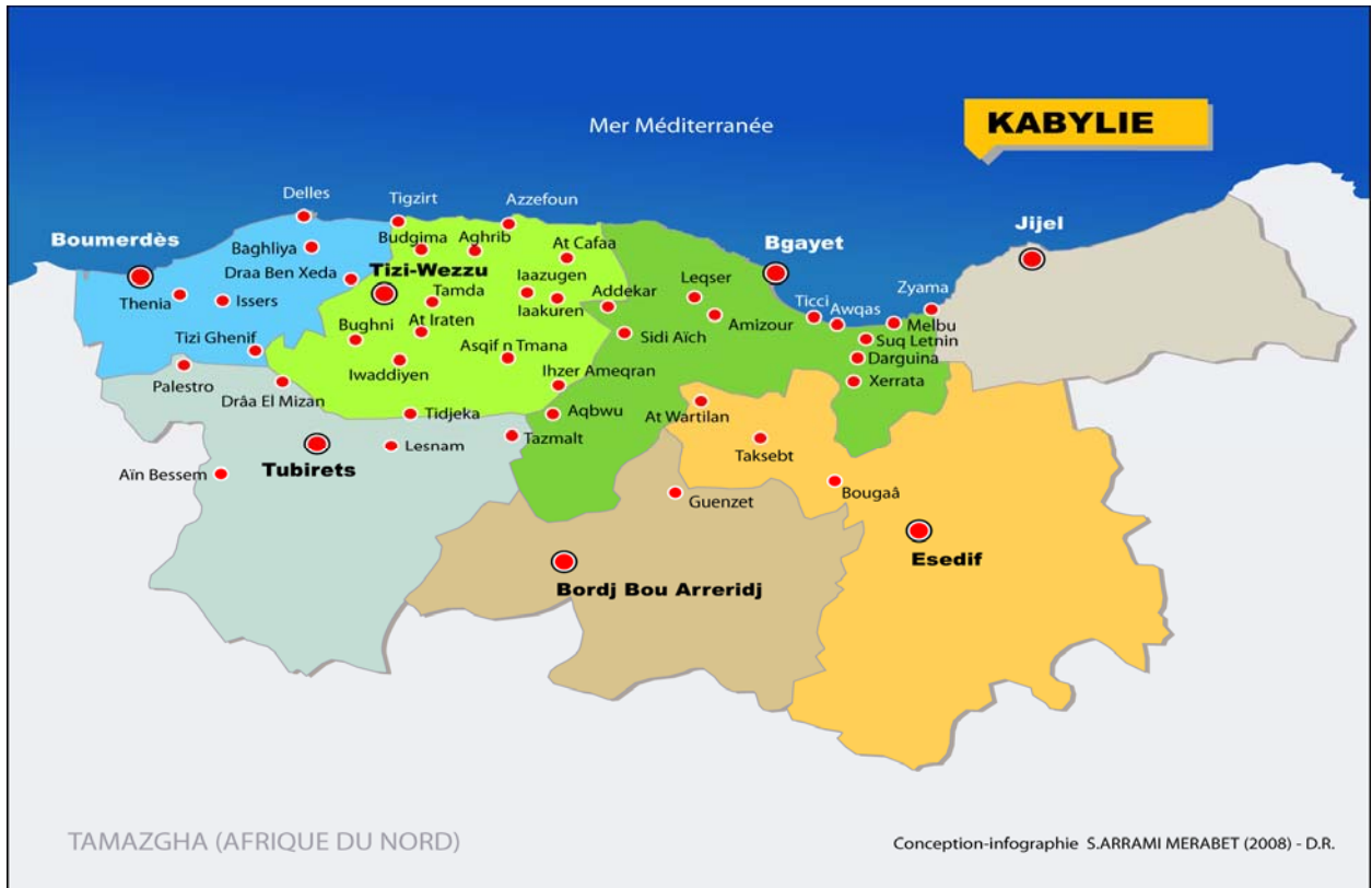
Figure 5. Kabylarian administrative divisions