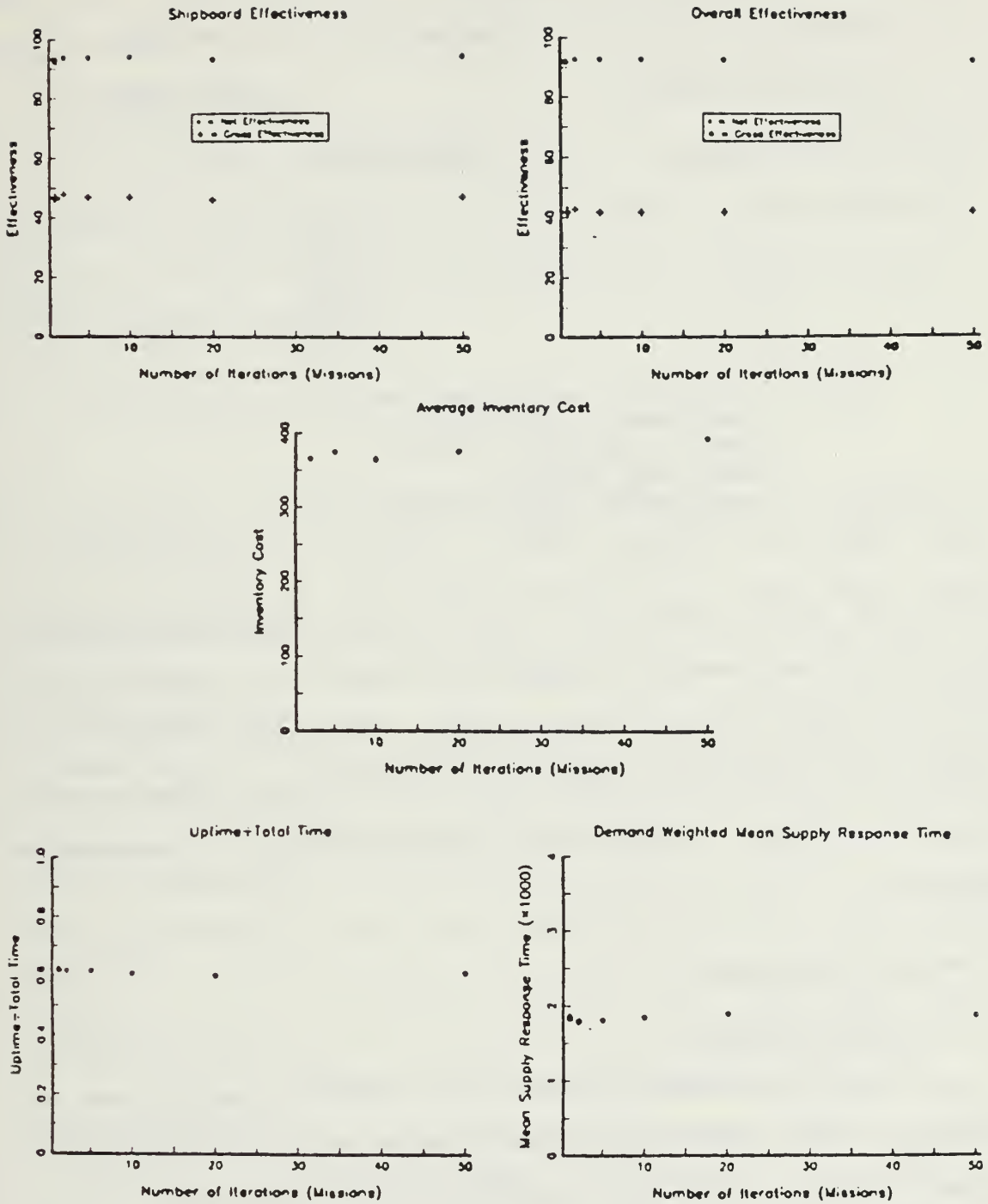
FIGURE 7.1 Measures of Effectiveness as a Function of Number of Iterations