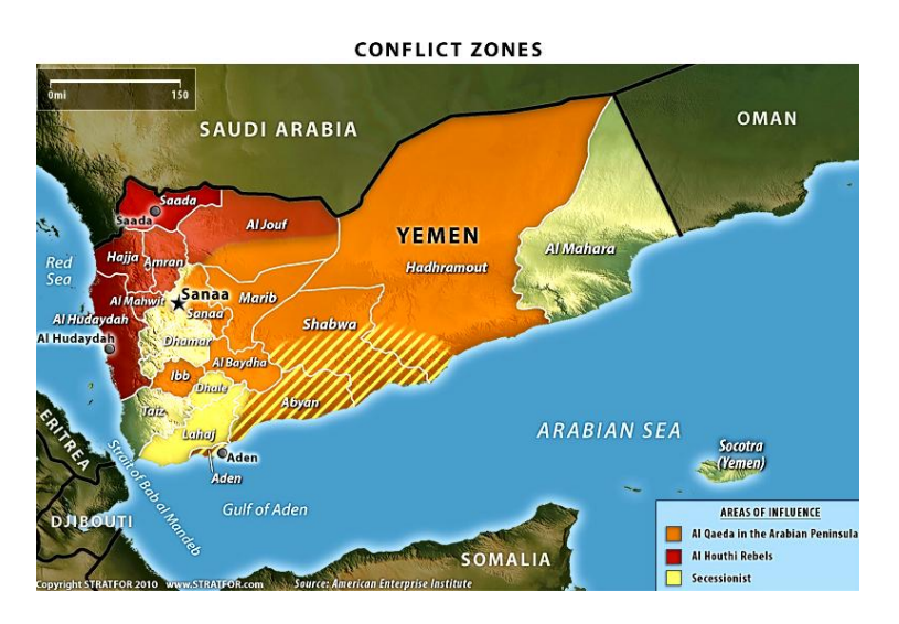
Figure 1. Map of Conflicts within Yemen<sup>167</sup>