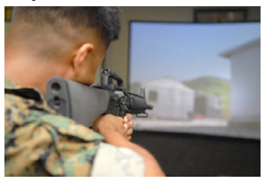
Figure 1. U.S. Marine Using an ISMT Trainer

The United States Marine Corps prides itself on the slogan "every marine is a rifleman." For this reason, the author researched the use of marksmanship simulators in the Marine Corps. More importantly, he examined studies that have been conducted to determine the effectiveness of these simulators in comparison to live fire training.