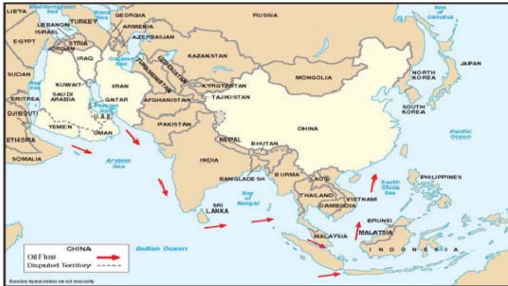
Figure 1. China's Critical Sea Lanes. 47

Domestic policy makers in Beijing have encouraged state-owned oil corporations to secure exclusive exploration and supply contracts with states that produce petroleum products. At the same time, Beijing has courted the governments of these countries with foreign aid, infrastructure development, and debt forgiveness. 48 As outlined above, often the countries that receive this attention are countries marginalized by the international community and the United States in particular; Beijing's courting therefore places it in opposition to Washington's interests. When Washington's interests are matched with those of the American business community, China may pay a price for its expansion. In 2005, the China National Offshore Oil Corporation (CNOOC) effort to purchase Unocal, a California-based company, led to inquiries and denunciations from American political and business interest. CNOOC withdrew its offer and Unocal was purchased for a lower bid by American-based Chevron-Texaco. To Beijing, the incident raised questions as to