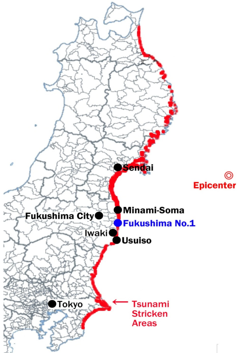
Figure 2. Tsunami-stricken areas. 11