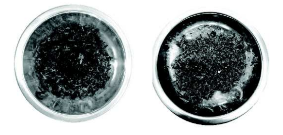
Figure 1. Digestate as a raw material without binder (left) and with addition of calcium carbonate (right).

located in Poland, specialized in processing maize silage (40%), cattle manure (30%), vegetable pomace (10%), chicken manure (10%) and pig manure (10%). Liquid fraction was separated and a solid matters with and without addition of binder were investigated in WULS Analytical Centre according to standards to determine the main chemical compounds in the raw materials (Table 1).