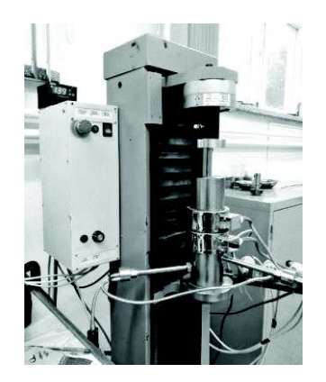
Figure 2. Testing stand for agglomeration process.

Depending on the analyzed case, the tested material were: pure digestate or digestate with addition of 10 or 20% of calcium carbonate. Initially, the outlet opening was closed with a pellet, and then the die was heated to a set temperature of 140 °C for 1 hour. When the temperature was stabilized at the entire height of the die, the study could be started. Measured samples of digestate without and with the addition