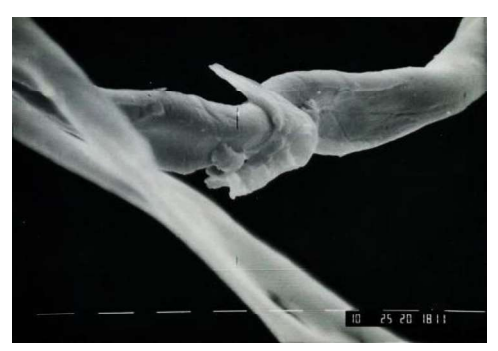
d) cracks and wall damage

Figure 1. Damages of cotton fibers with microorganisms.