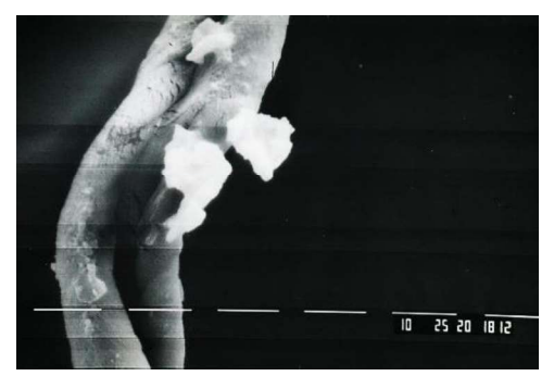
c) overgrowing and blotch