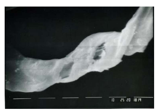
a) overgrowing, blotch, deep cracks

Microscopic examination of samples shows damage, such as destruction of the wall; almost all the fibers have overgrowing. The brown fiber (k = 1.59) has wall damages. Beige and white fibers have high biostability under these conditions: the values of the destruction indicator do not exceed 0.47 (7 times weaker than the green fiber).