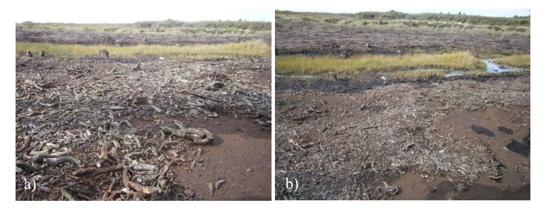
Figure 3. Burning of forests to clear land for cultivation.

Important information is provided in Table 2, which lists the main factors and data on the collection of wood in the target area. The data in the table shows that wood resources are often very distant, which is one of the impacts of high deforestation; on the other hand, the low value of distance demonstrates the easy availability of wood fuel from their own garden or adjacent land.