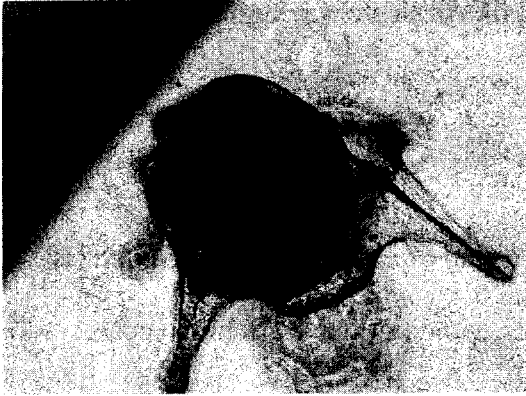
Fig 1 : Juvenile rudiment inside echinopluteus