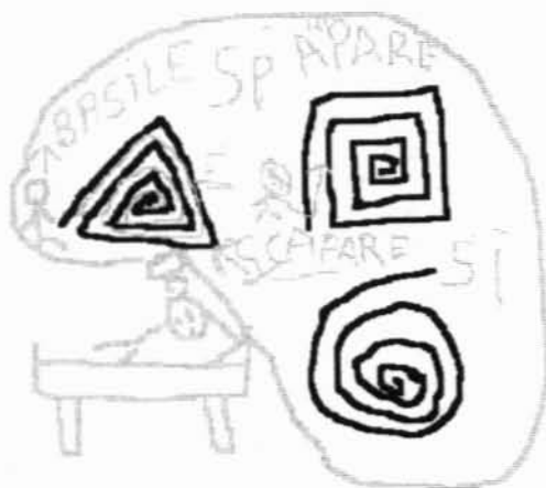
FIGURE 10 Basile in Bed; the Brain; the Flashbacks; the Pathway to Healing