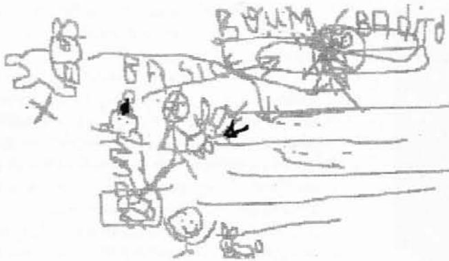
FIGURE 3 Basile, The Rabbit, and The Killer.