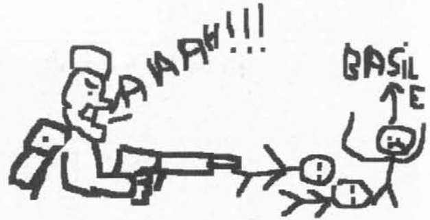
FIGURE 6 The death of Basile's friends.