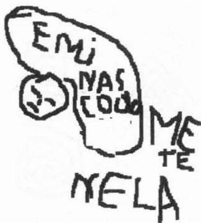
FIGURE 13 Basile's Brain.

mouth muscles with difficulty, pronouncing the word "mum," and then "Veronique," and other names.