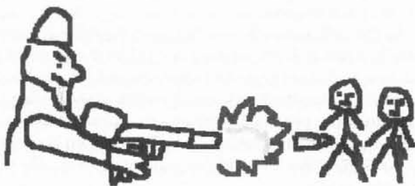
FIGURE 5 The Killer shoots.