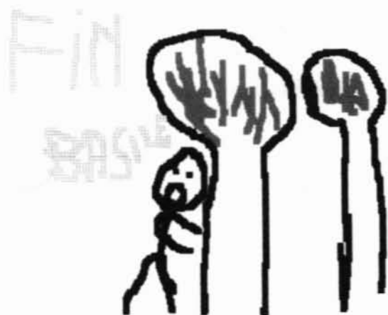
FIGURE 9 Basile is hiding in the woods.