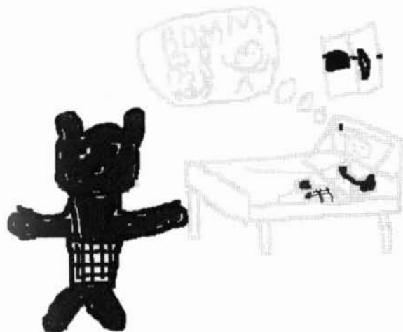
FIGURE 11 Basile in bed; the Bear; the detachment of the mind.