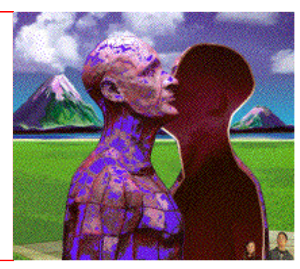
Olum Hemi-Bust 10 AM westward / Olum Hemi-Bust 3 PM Eastward Click to enlarge.