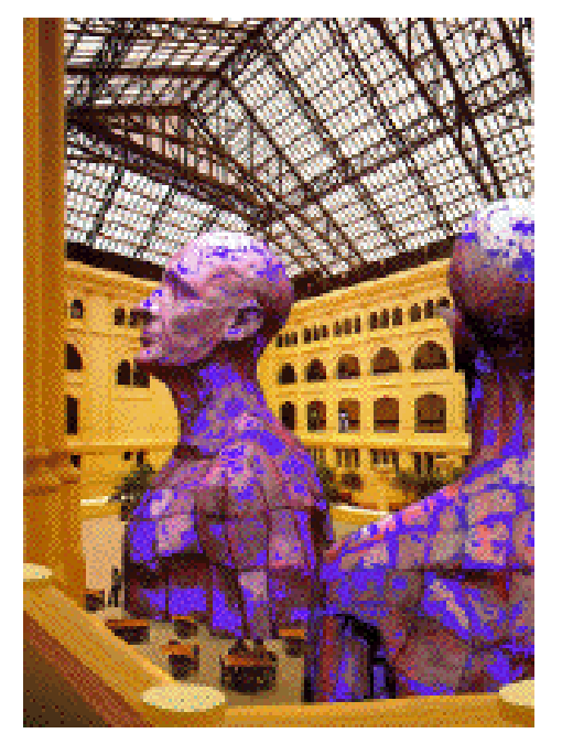
Olum Mobile Hemi-Bust on tour Click to enlarge.

Olum, as a figure of 20th Century, local yet global, principled and intelligent, should remain in human memory. The Paul Olum Mobile Hemi-Bust is a celebration of the heroic and the tragic. In my opinion a fate which too few share.