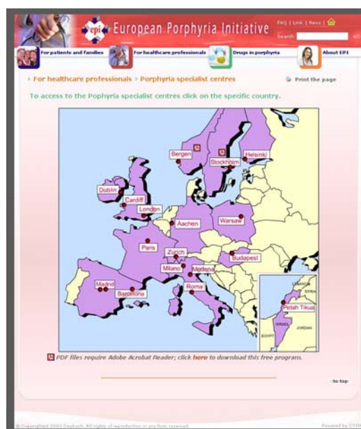
Fig. 2. EPI website list of partners in December 2004

of safe and unsafe drugs and setting up an external quality assurance scheme.