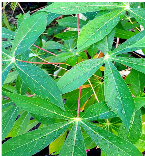
Fig. 2 Manihot esculenta Crantz. From: Richard Wong Garden & Woodwork In: Poisonous Yet Nutritious [64]. ( http://wrgardenwoodwork.blogspot.com/2017/07/ )

rat liver, at the lower concentrations in uni-nephrectomized, high-fat-diet-fed rats, and at all the extract concentrations in the high-fat-diet-fed, uni-nephrectomized rats. These findings were consistent with the results of another study which revealed that the crude ethanolic extract of Manihot esculenta leaf inhibited mitochondrial pore opening in both normal and type 2 diabetic Sprague-Dawley rats, both in vivo and in vitro , which may be due to the significant antioxidant