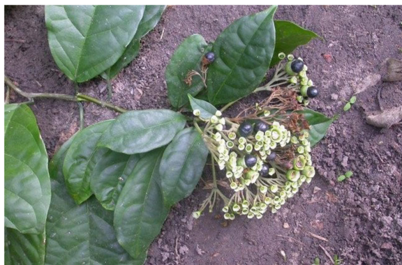
Fig. 1 Clerodendrum volubile . Molehin et al., 2017 [29]. Molehin OR, Oloyede OI, Boligon AA. Comparative study on the phenolic content, antioxidant properties and HPLC fingerprinting of the extracts of Clerodendrum volubile . P. Beauv. J App Pharm Sci. 2017a; 7:135–140

rat liver, at the lower concentrations in uni-nephrectomized, high-fat-diet-fed rats, and at all the extract concentrations in the high-fat-diet-fed, uni-nephrectomized rats. These findings were consistent with the results of another study which revealed that the crude ethanolic extract of Manihot esculenta leaf inhibited mitochondrial pore opening in both normal and type 2 diabetic Sprague-Dawley rats, both in vivo and in vitro , which may be due to the significant antioxidant