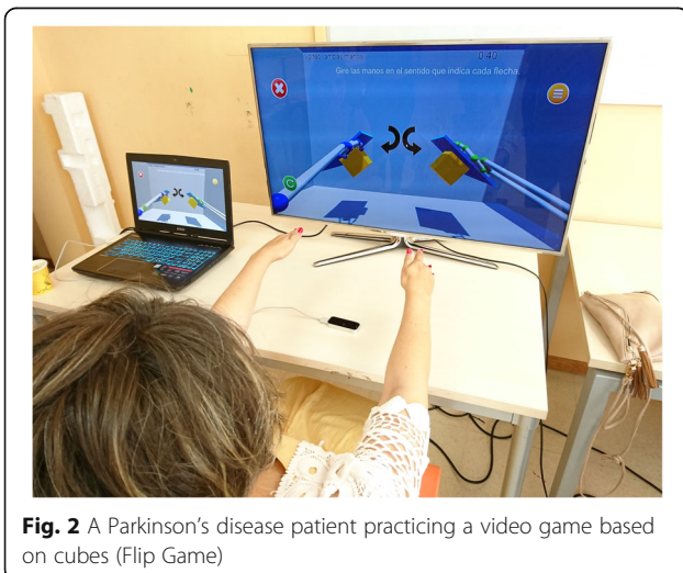
Fig. 2 A Parkinson's disease patient practicing a video game based on cubes (Flip Game)

FG: This game trains pronation and supination movements of the forearm. The user must place the palm of the hand over the Leap Motion device imitating a waiter holding out a tray (Fig. 1f). A small tray with a cube in the middle appears in the center of the screen. The patient should then turn the palm downwards. Upon doing so, the cube detaches from the tray and falls to the ground (Fig. 2).