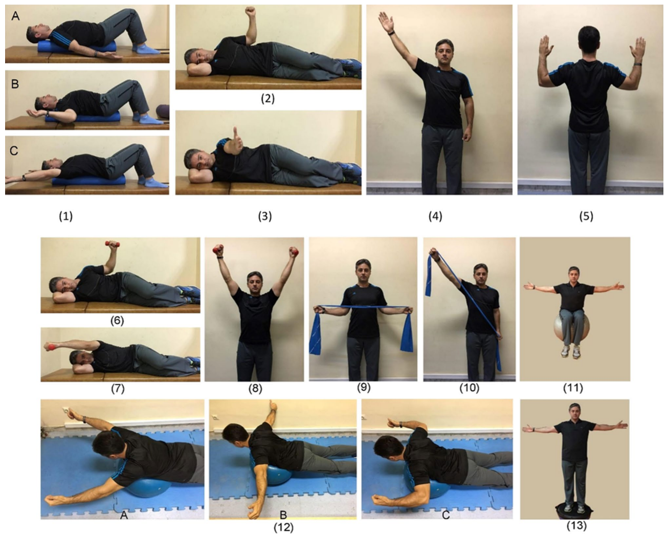
Figure 3. The initial phase exercises: lay supine on the foam roll in three different arm abduction angles (exercise 1A-C), side-lying external rotation (exercise 2), side-lying forward flexion (exercise 3), standing diagonal flexion (exercise 4), and military press (exercise 5). Improvement phase exercises: side-lying external rotation with dumbbell (exercise 6), side-lying forward flexion with dumbbell (exercise 7), standing diagonal flexion with Thera-band (exercise 8), standing diagonal flexion with Thera-band (exercise 9), abduction in sitting on a training ball (exercise 11), lying prone V, T, and W exercises (exercise 12), and abduction in standing on the balance board (exercise 13).

uring muscle activation. Muscle activation ratios were also calculated for the mean EMG amplitude; a ratio less than one indicates higher MT, LT, or SA activation than UT, and an amount greater than one indicates greater UT activation than MT, LT, or SA 46 . Only the concentric phase of the motion was used to determine the onset of muscle activity, and it was based on the onset of the deltoid muscle. Moreover, the onset of muscle activation was from the point where the level of muscle activity reached three standard deviations above the rest of the muscle activity 46 .