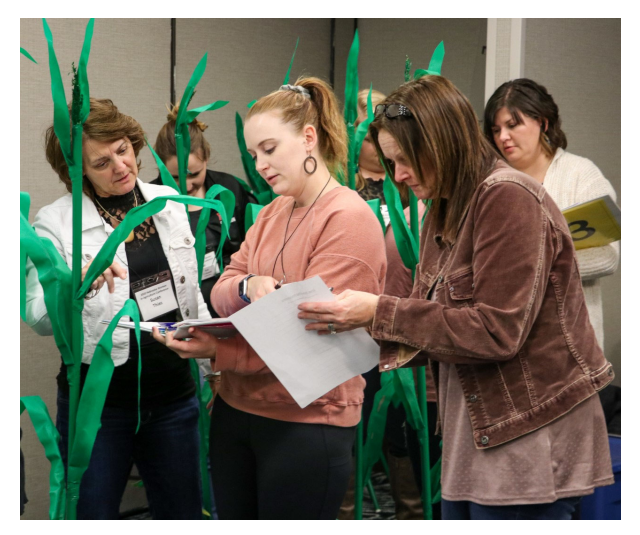
Nebraska Women in Agriculture Conference participants practice their crop scouting skills, during one of the 35 workshops offered at the event.

business decisions. Sessions covered risks in production, marketing, financial, human and legal areas. Training opportunities ranged from crop and livestock insurance to recording keeping and using financial documents to succeed.