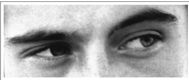
FIGURE 2. An example of a male eye gaze stimulus in the RMET. The word choices were apologetic , friendly , uneasy (correct), and dispirited .