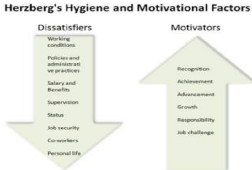
Figure 2. Herzberg's Hygiene and Motivational Factors

Contrary to the hygiene criteria, Herzberg's motivating requirements are satisfied through inspiring or fulfilling causes. Achievement, appreciation, the job itself, obligation, and growth, whereas hygiene variables contribute to working incentive variables, the job's quality, and its effect. Theory shows that those who satisfy the demand for self-actualization and self-fulfillment in a person's work are the factors leading to job fulfillment. Only through the success of the job can people enjoy the prizes that enhance their aspirations. When appreciation, obligation, and other motivator element are not missing from work, the outcome won't be discontent, as with the absence of hygiene factors, but rather the same neutrality as a hygiene factor, which contributes to a neutral condition, which is either not acceptable or not happy at present. Furthermore, two Variables' hypothesis was criticized for failing to consider human desires and beliefs in understanding inspiration for function, as shown in figure 2.