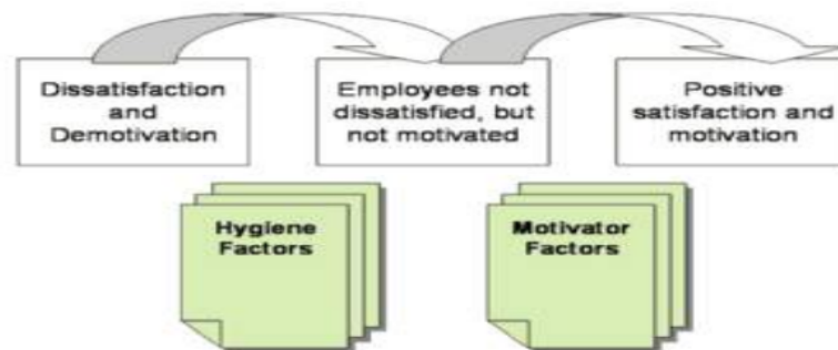
Figure 1. Herzberg's Two Factor Hypothesis

Herzberg's Two Factor Hypothesis implies that human beings have two separate requirements and that the multiple aspects of the job scenario fulfill or do not fulfill both requirements. Herzberg and his colleagues suggested a new theory of job satisfaction, which analyzed the early work satisfaction literature, both theoretical and functional. They did not see any correlation between job satisfaction and job results. They also concluded that employees' attitudes and actions are systematically related, but these links also gone overlooked because scientists have misunderstood work fulfillment and dissatisfaction. They decided that happiness with the position relies on a certain collection of factors, while position frustration typically arises from various employment conditions. Therefore, while happiness and disappointment can be seen as two poles in a common spectrum, two distinct factors decide them themselves, as shown in figure 1.