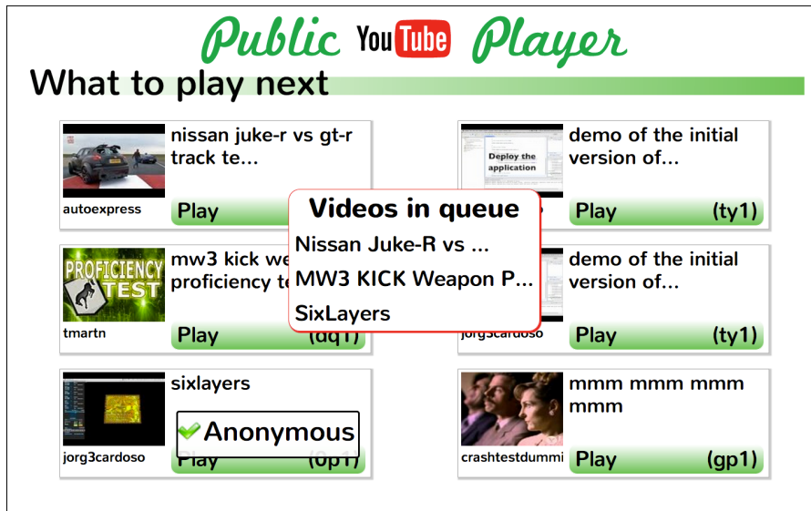
Figure 2. Widgets in the context of a public display application.

Any user can interact with any of these features at any time, using any of the interaction mechanisms mentioned before.