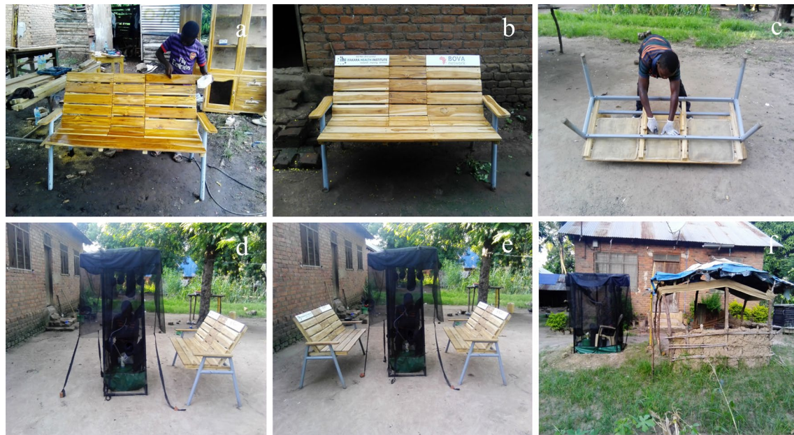
Fig. 2 Design and prototyping of the wooden chairs at the local carpentry (a), overview of the prototyped chair (b), fitting transfluthrin-treated hessian mat underneath the chair (c), one transfluthrin-treated chair with the DN-Mini trap positioned 0.5 m (d), two transfluthrin-treated chairs with DN-Mini trap installed 0.5 m (e); and outdoor kitchen fitted with transfluthrin-treated sisal ribbon with DM-Mini trap positioned 1.2 m (f)

part of the chair (Fig. 2c). These mats were made by a local seamstress at the Ifakara Health Institute fabrication facility (the MozzieHouse). The hessian mats had been treated in emulsified solutions containing 2% transfluthrin (Bayer AG, Germany), prepared as previously described [31, 33].