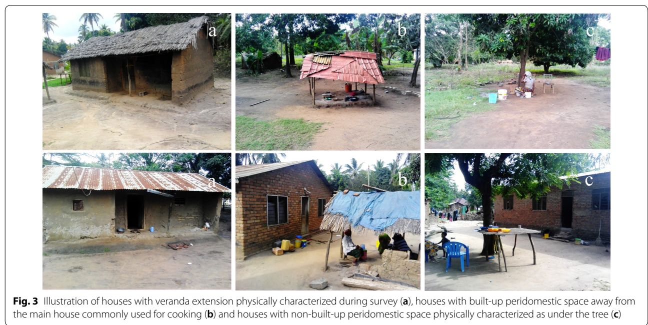
Fig. 3 Illustration of houses with veranda extension physically characterized during survey (a), houses with built-up peridomestic space away from the main house commonly used for cooking (b) and houses with non-built-up peridomestic space physically characterized as under the tree (c)

Findings on protective efficacy of the two interventions are summarized in Tables 3 and 4. Using two transfluthrin-treated chairs significantly reduced outdoor-biting An. arabiensis mosquitoes by 76% (Relative rate (RR)=0.24, 95% confidence interval, CI 0.19–0.29, P<0.001 ) and by 85% (RR=0.15, 95% CI 0.12–0.18, P<0.001 ) in dry and wet seasons, respectively. Using one transfluthrin-treated chair also significantly reduced An. arabiensis mosquitoes, in this case by 70% (RR=0.30, 95% CI 0.25–0.37, P<0.001 ) and by 75% (RR=0.25, 95% CI 0.20–0.31, P<0.001 ) in dry and wet seasons. When the densities of Culex mosquitoes were assessed, both the two-chair and one-chair interventions significantly reduced outdoor-biting, achieving 52% (RR=0.48, CI 0.37–0.63, P<0.001 ) and 58% (RR=0.42, 95% CI 0.31–0.56, P<0.001 ) protection, in dry and wet seasons, respectively. In the wet season, both the two-chair and one-chair interventions significantly reduced outdoor-biting, achieving 51% (RR=0.49, CI 0.43–0.56, P<0.001 )