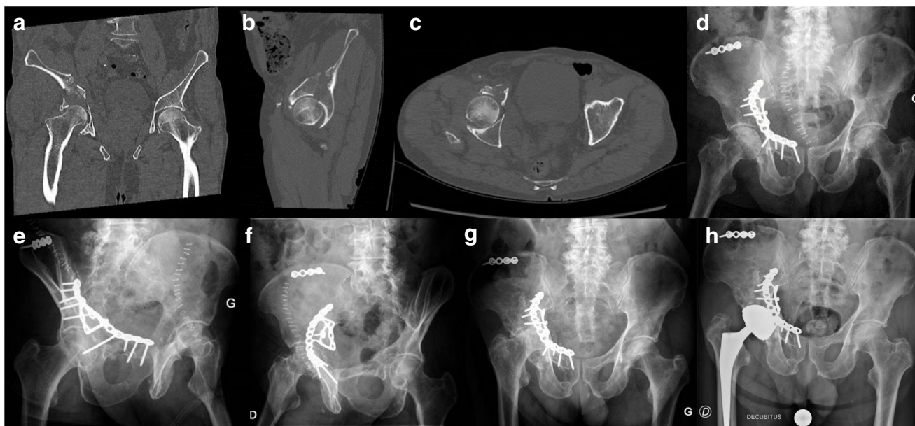
Fig. 1 Pre-operative coronal, sagittal and axial views (a, b and c) on CT scan of an 87-year-old male patient who sustained an anterior column with posterior hemi-transverse fracture. (d, e, and f) Post-operative anteroposterior, obturator, and iliac X-rays after ORIF. (g)

Anteroposterior pelvic X-ray at 15 months of follow-up showing osteonecrosis of the femoral head and acetabular collapse. (h) Anteroposterior pelvic X-ray after secondary THA with dual mobility cup.