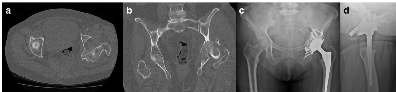
Fig. 2 Pre-operative axial (a) and coronal (b) views on CT scan of an 82-year-old female patient who sustained a comminuted posterior wall fracture associated with posterior hip dislocation treated by DM-CHP with

There were 21 patients in the SA-ORIF group and four patients in the CA-ORIF group. There were 18 patients in the SA-CHP group (Fig. 2) and eight patients in the CA-CHP group (Fig. 3). Mean surgery time and intra-operative blood loss were higher for combined approaches in each group. Early complication rate was 11.1% (2/18) in SA-CHP compared with 75% (6/8) in CA-CHP ( p = 0.003 ). Early