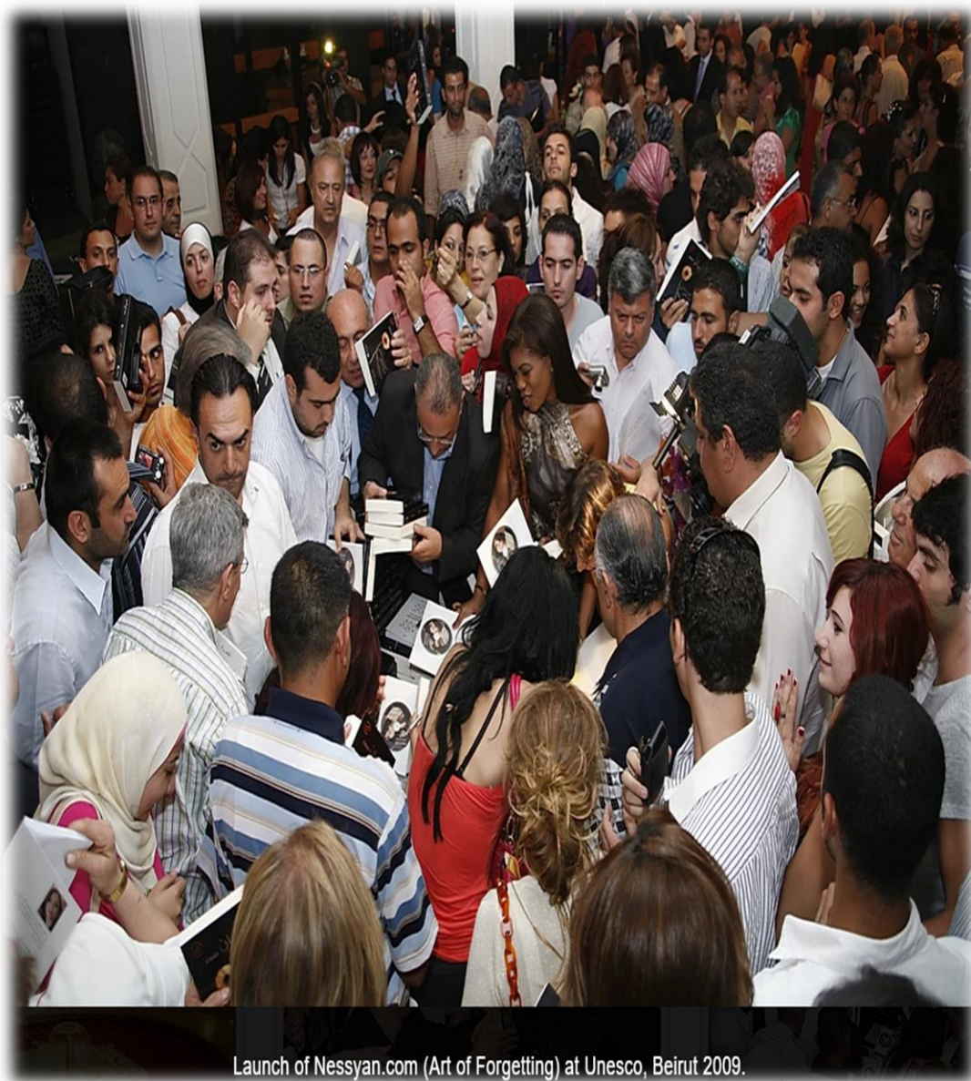
Launch of Nessyan.com (Art of Forgetting) at Unesco, Beirut 2009.

Reference: Mosteghanemi, A. [ Image post]. Retrieved from