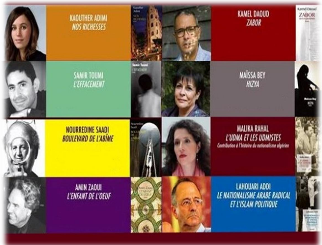
Image 2: Algerian Francophone authors invited by Barzakh publishing house to the SILA event

Reference: Viny Culture (2017, October 26). Programme des éditions Barzakh au SILA. [Image post]. Retrieved from https://biturl.top/63Mjlf