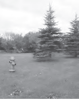
Fire hydrant on Glenn Street