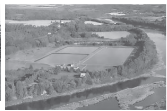
Wastewater treatment plant located on the Grimes Road