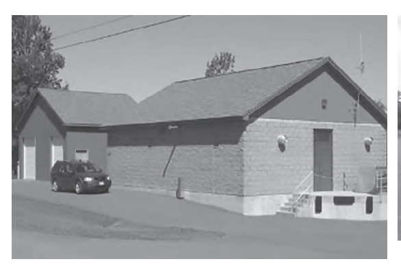
Water treatment plant located on the River Road