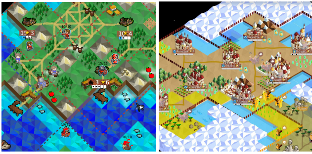
Figure 1: Tribes (left) and The Battle of Polytopia (right).

combat. Combining all of them requires effective decision making and enables different playing strategies. Managing the economy revolves around the accumulation of game currency ( stars ). These are produced by all the cities owned by the tribe and are awarded at the beginning of each turn. The collection of resources and construction of buildings adds population to cities, which then level up every time the population reaches a target (city level+1). Leveling up augments the star production of the city and provides bonuses to choose from (extra production, resources, city border growth, etc). If a city reaches level 5 or higher, a specially strong unit (a superunit , or Giant ) can be spawned. Each tribe unlocks new features by spending stars to research up to 24 technologies in the tech tree, including the construction of new buildings, ability to gather new resources within the city borders or traverse water and mountain tiles.