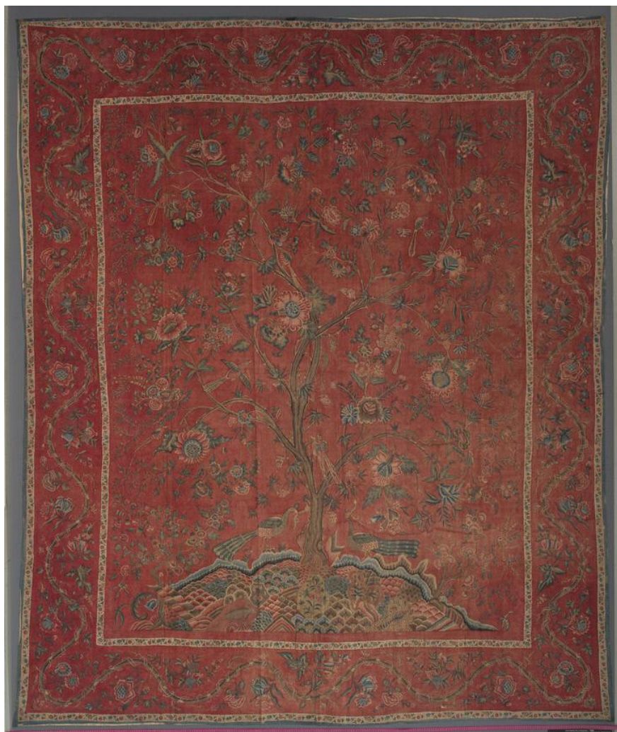
Figure 11. Palampore (textile panel), Chintz: cotton tabby, painted, mordant-dyed, resist-dyed, overpainted, made in coastal southeast India, for the Western, possibly Dutch, market, c. 1750. Gift of Louise Hawley Stone Charitable Trust, Royal Ontario Museum (2011.27.1).