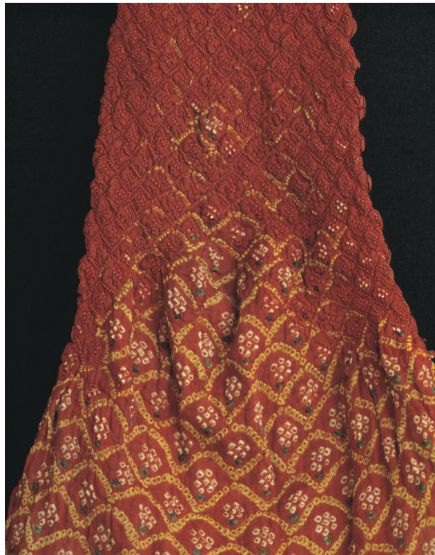
Figure 4. Turban cloth, tie-dyed cotton ( chunnarī ), Kotā, c. 1860, 7885(IS).