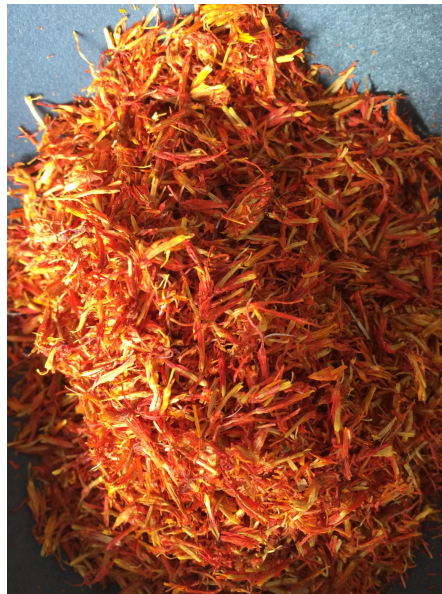
Figure 7. Safflower petals.

While the figure's dress in the painting has been colored through spontaneous play, dyers also offered their services to spray garments with color around the time of Holi. A nineteenth-century account from Nāshik (northern Maharashtra) stated that local safflower dyers, some of whom had emigrated from Mārwar in Rajasthan, were particularly busy "on the fifth day of the Holi festival (March and April), when people send their clothes to be sprinkled with red" (Campbell 1883, p. 174). Techniques for "sprinkling" clothing likely varied. Some textile dyers may have blown the dye through a straw to create a haze of color. While the makers of lahariyā textiles used folding, tying, and dyeing techniques to approximate the waves of water that appeared in nature during the monsoon, the Holi dyers sought to replicate the appearance of cloth that had been doused with colored powders and dyes.