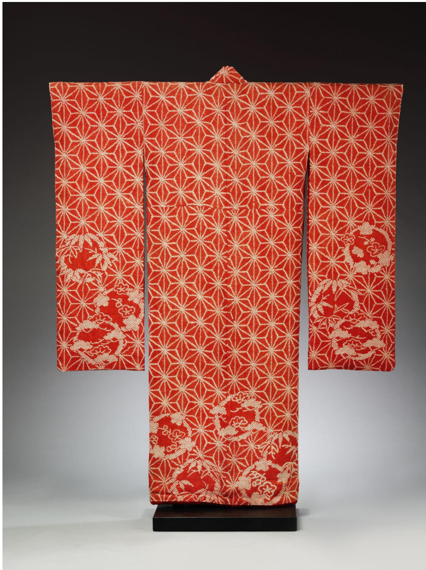
Figure 1. Kimono dyed with safflower; figured satin silk with tie-dyed decoration; Japan, 1800–1840. FE.32-1982.