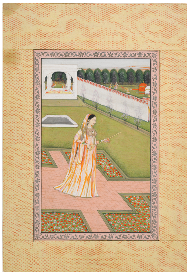
Figure 10. Unknown Artist, “Lady Alone at Holi Festival”, opaque watercolor and gold on paper, Pahari School, Kangra, Himachal Pradesh, c. 1780. Harvard Art Museums/Arthur M. Sackler Museum, Gift of John Kenneth Galbraith, 1971.133.