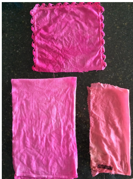
Figure 8. Cotton, linen, and silk dyed in safflower by the author.