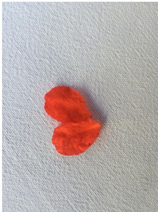
Figure 2. Petals of the Gul-i Anār (Pomegranate Flower).

permits the exact quantity of sour lemons to be decided by the dyer: while pomegranate flowers have a sharp, orange–pink tone, the dyer could choose just how biting to make the hue. Finally, the cloth dries in the shade a second time; one would never dry a safflower-dyed textile in the sun, as it would already begin to fade.