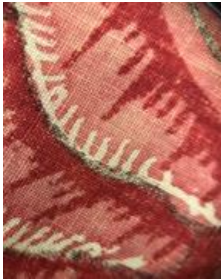
Figure 12. Detail of Figure 11, Courtesy of the Royal Ontario Museum, © ROM. Photograph: Sylvia Houghteling.