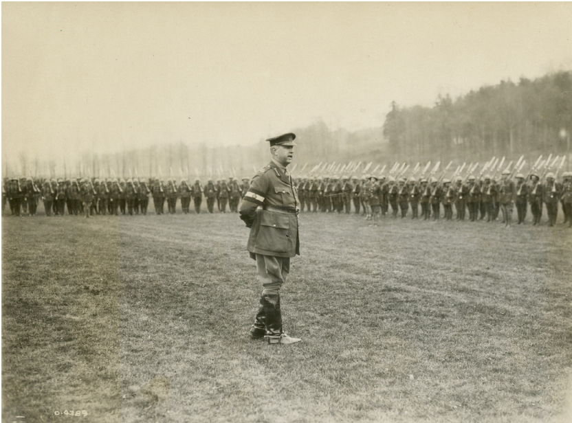
Corps commander Lieutenant-General Sir Arthur Currie addressing the 78th Battalion in April 1919.

of his last letters from England, he was anxious to serve at the front and begin “doing my bit as I expected to when I enlisted” more than a year earlier. 14