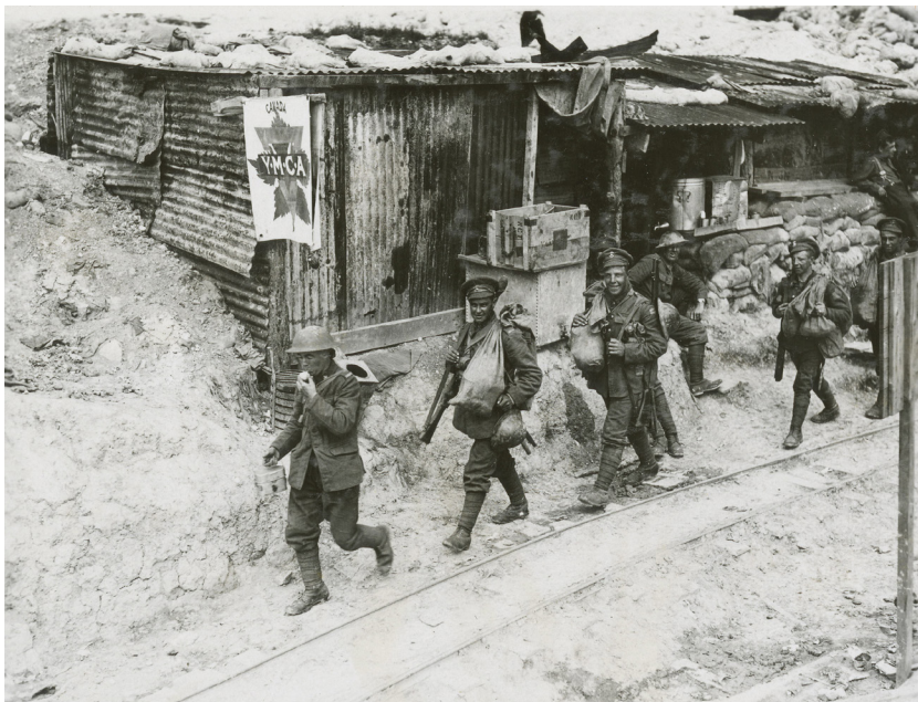
78th Battalion men leaving YMCA dugout near the front line.

The Canadian Corps had delivered a victory on the Somme at Courcellette on 15 September 1916, striking across No Man's Land with the aid of tanks and a creeping barrage, but after that the fighting had been slow and costly. Both sides attacked and counterattacked. When the Canadians had time to prepare for their assaults, especially in softening up the enemy trenches with shellfire, they were able to grind forward, such as on the 26th of September, but two rushed attacks against Regina Trench on the 1st and 8th of October were costly slaughters. 23