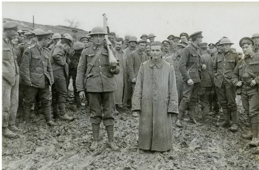
German prisoner captured by the 78th Battalion during a night raid in early 1918.

recognition as much as I did.” 35 As part of the Canadian Corps’ desire to gather intelligence on the enemy, win control of No Man’s Land, hone tactics and attrite the enemy’s morale, the Canadians had been systematically attacking the enemy lines through a series of minor operations. 36 From January 1917, this reign of terror slowly beat back the Germans, who by March were wary of even leaving their trenches.